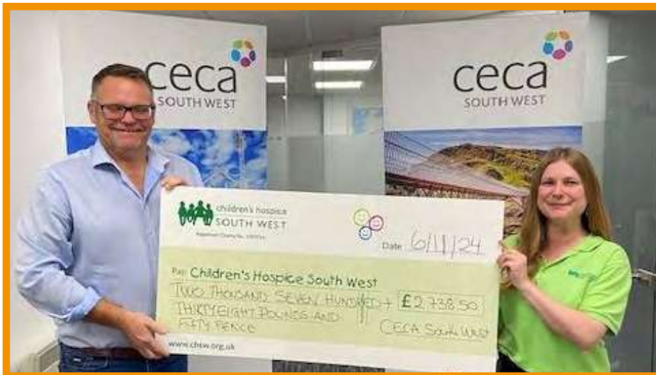
Above: Another whopping £2,738 raised by CECA SW members at our Annual Lunch and Young Achievers' Awards event, which took place in October