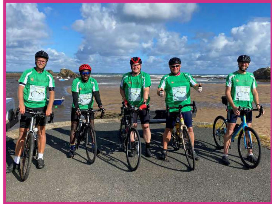
CECA SW members' 'Devon Triangle' charity bike ride route took in Exeter, Bude and Plymouth, raising funds for Children's Hospice South West

You can still donate to this worthy cause via the QR code below: