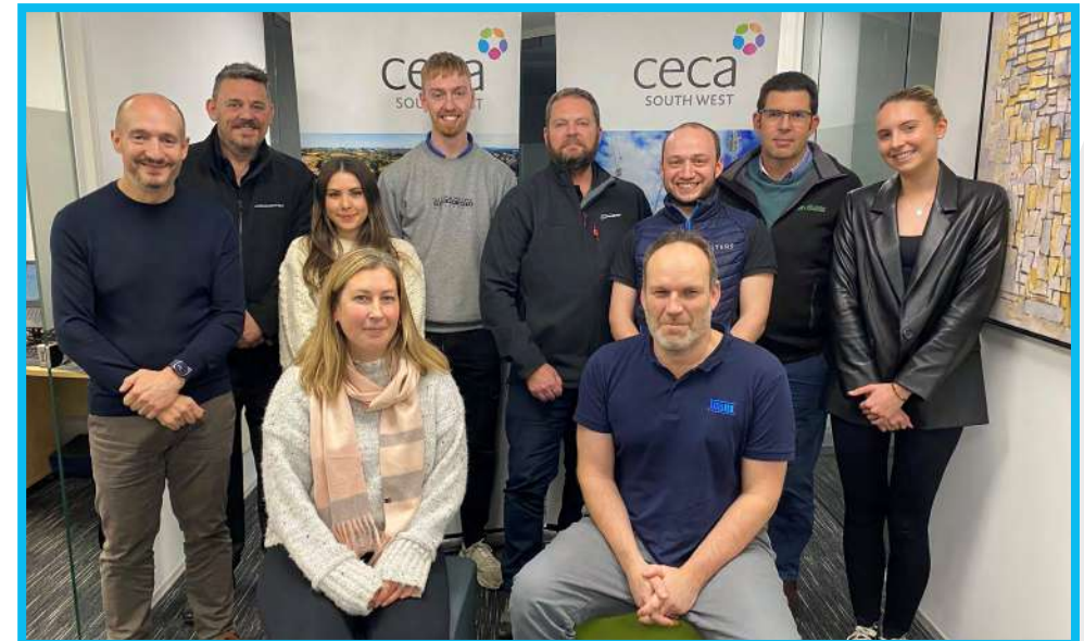
Above: The first of a series of bid writing courses, run by Impart, took place at CECA SW's HQ in November