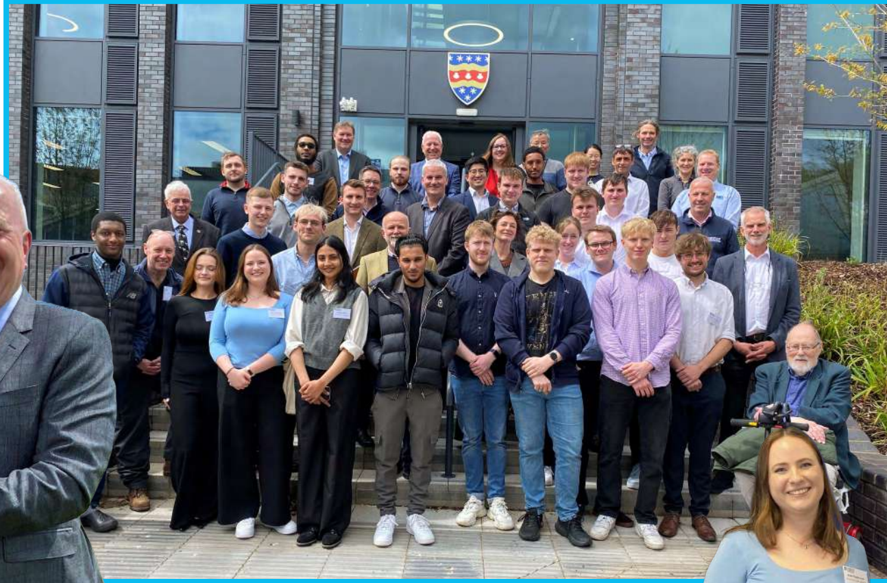
Above: CECA members and Plymouth University students and lecturers at their Project Showcase event in May, celebrating the strong links between the region's civil engineering industry and academia

CECA South West retains close links with universities throughout our region with a view to creating a talent pipeline and ensuring our members can recruit from a skilled workforce.