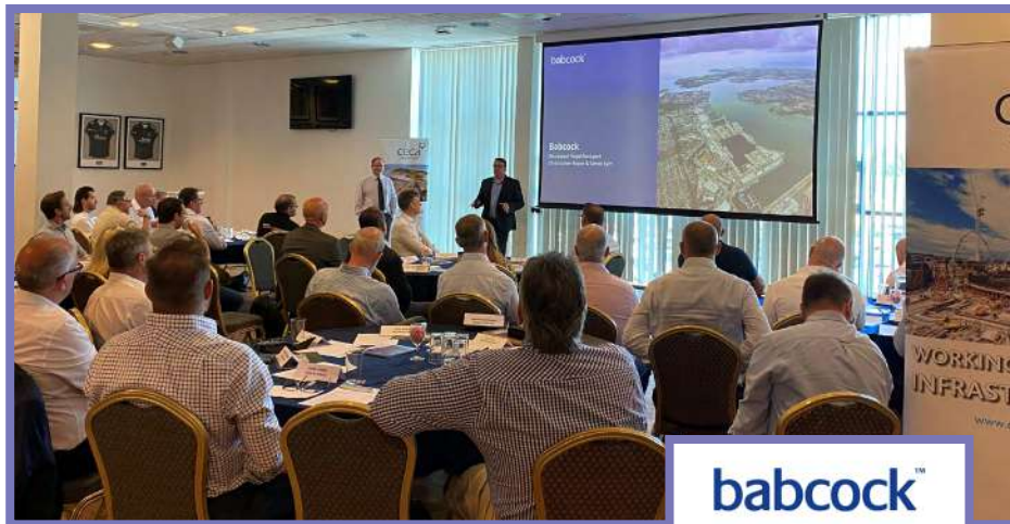
Above: Babcock directors presenting at one of CECA SW members' meetings at Sandy Park

The following pages illustrate the wide range of South West and national clients with whom CECA South West has engaged in 2024.