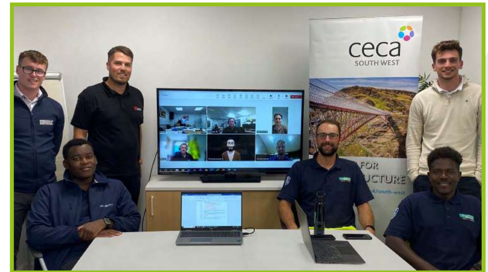
Left: highlighting civil engineering as a career of choice Avonbourne Academy, Bournemouth; & Presenting a CECA SWFG careers video at Uffculme School, Devon