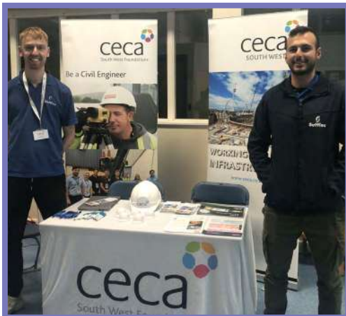
Above & below right: the CECA SWFG meets regularly at CECA SW HQ to plan its careers outreach and CPD programmes