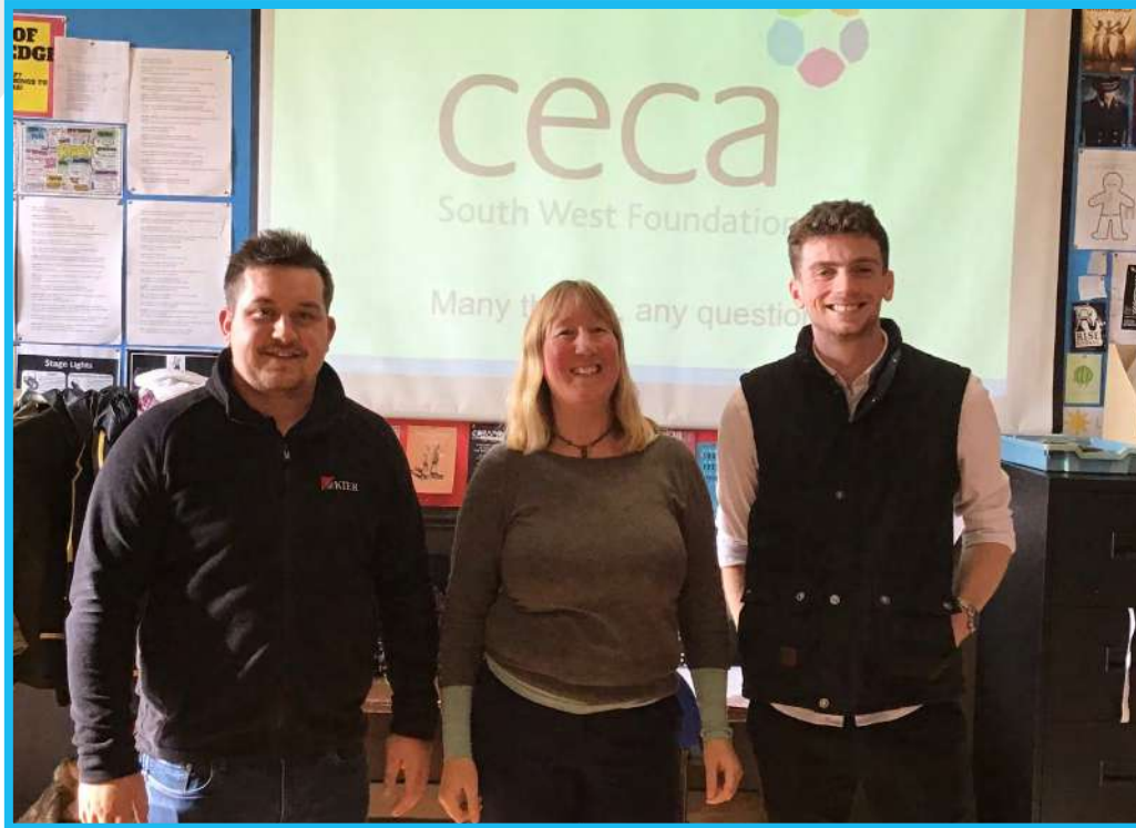
Above: presenting to students in the company of teaching staff at Shaftesbury School