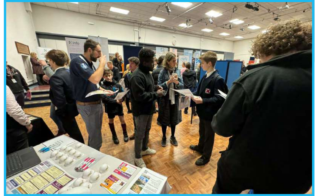
Above: the CECA SWFG Stand at the National Apprenticeship Show, Exeter, February 2024; Right: Exeter School Careers Fair