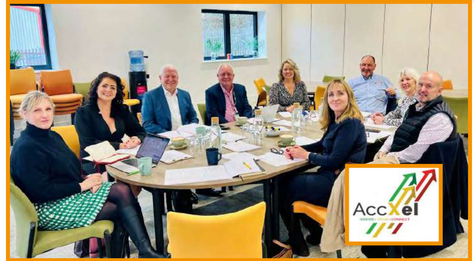
Above: CECA SW has a seat on the board of AccXel, the UK's first industry-led construction school