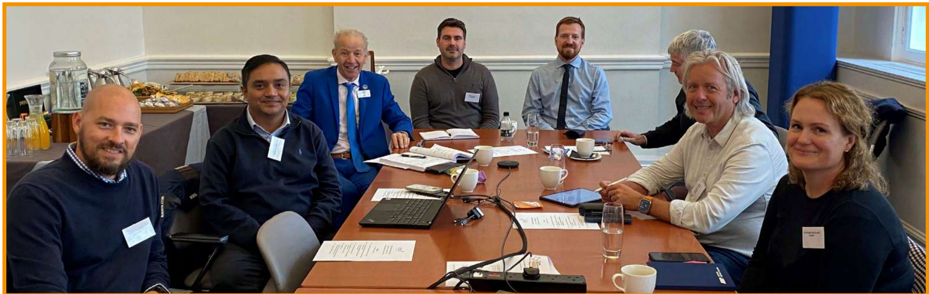
Above: CECA South West hosts the CECA Flood & Marine Group, which meets every quarter