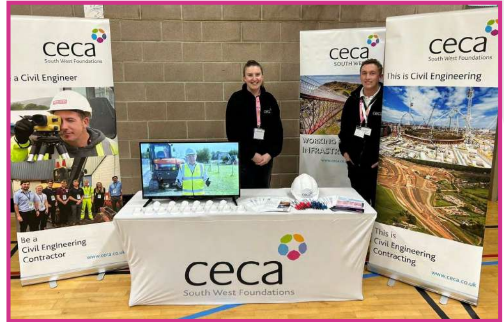
Above: CECA SWFG members prep for the day at Spires College, Torquay