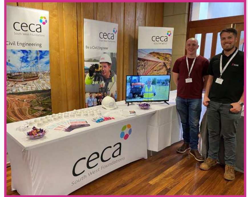
Above: making the case for infrastructure at Blundell's School, Tiverton. Below: with Ben Collins (aka 'The Stig') at Blundell's School