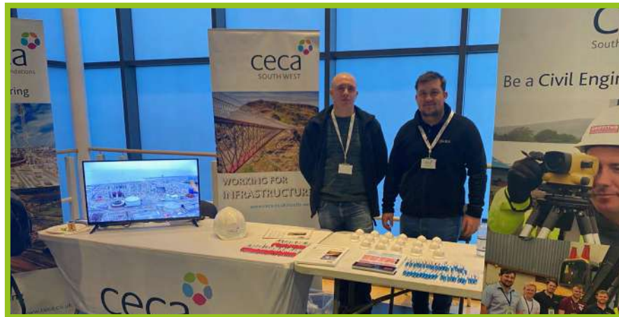
Below: primed to answer questions about opportunities in the industry at Bridgwater & Taunton College