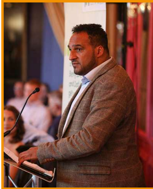
Guest speaker Michael Caines MBE