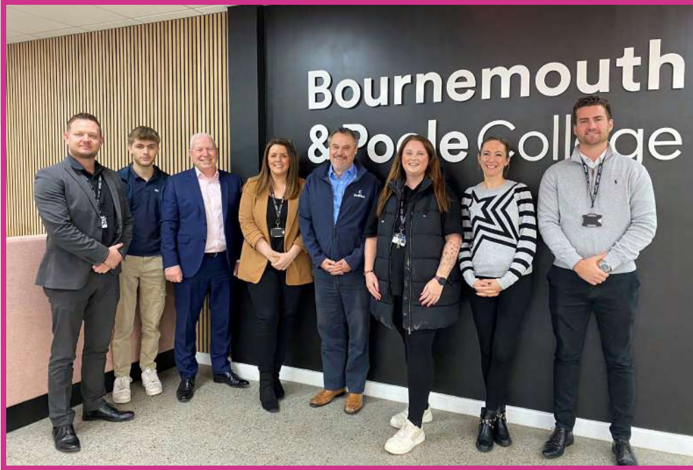
CECA SW members and Bournemouth & Poole College are launching a Level 2 Groundworker Apprenticeship Course , largely thanks to land being provided for the practical training by Suttles at its Hamworthy depot in Poole