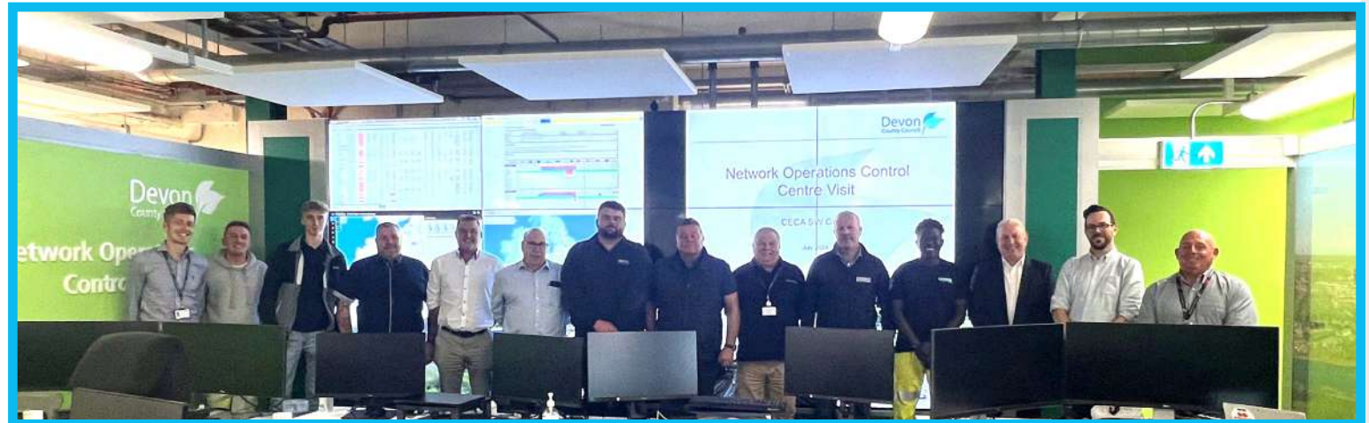
CECA SW members visited Devon County Council's Network Operations Control Centre in Exeter in July