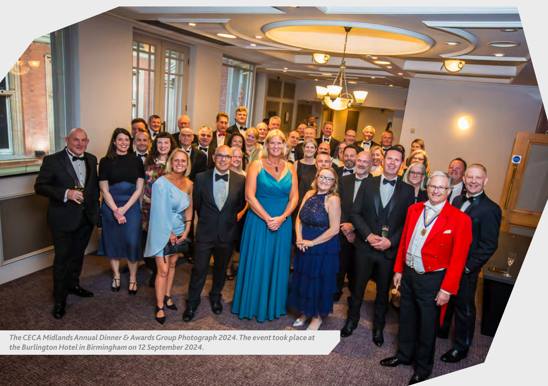
The CECA Midlands Annual Dinner & Awards Group Photograph 2024. The event took place at the Burlington Hotel in Birmingham on 12 September 2024.