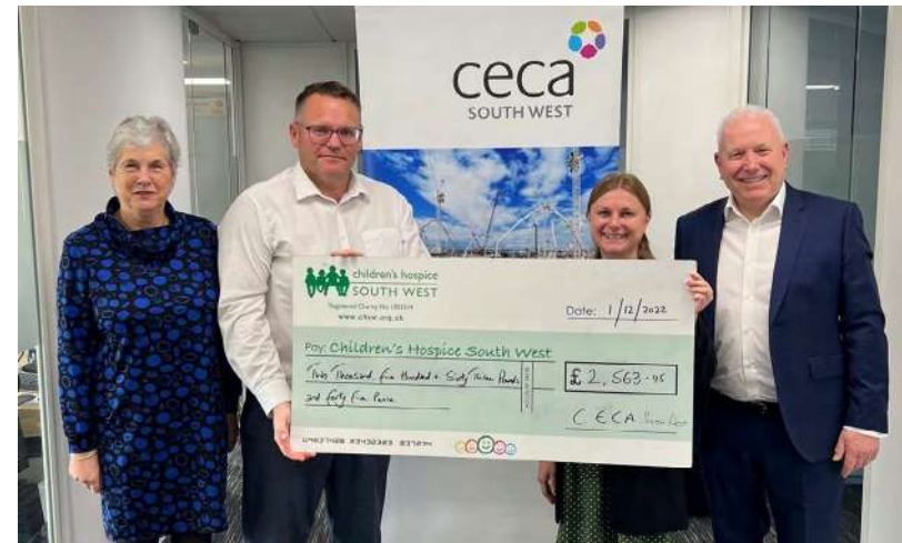
Children's Hospice South West - CECA South West's chosen charity for 2022 & 2023.